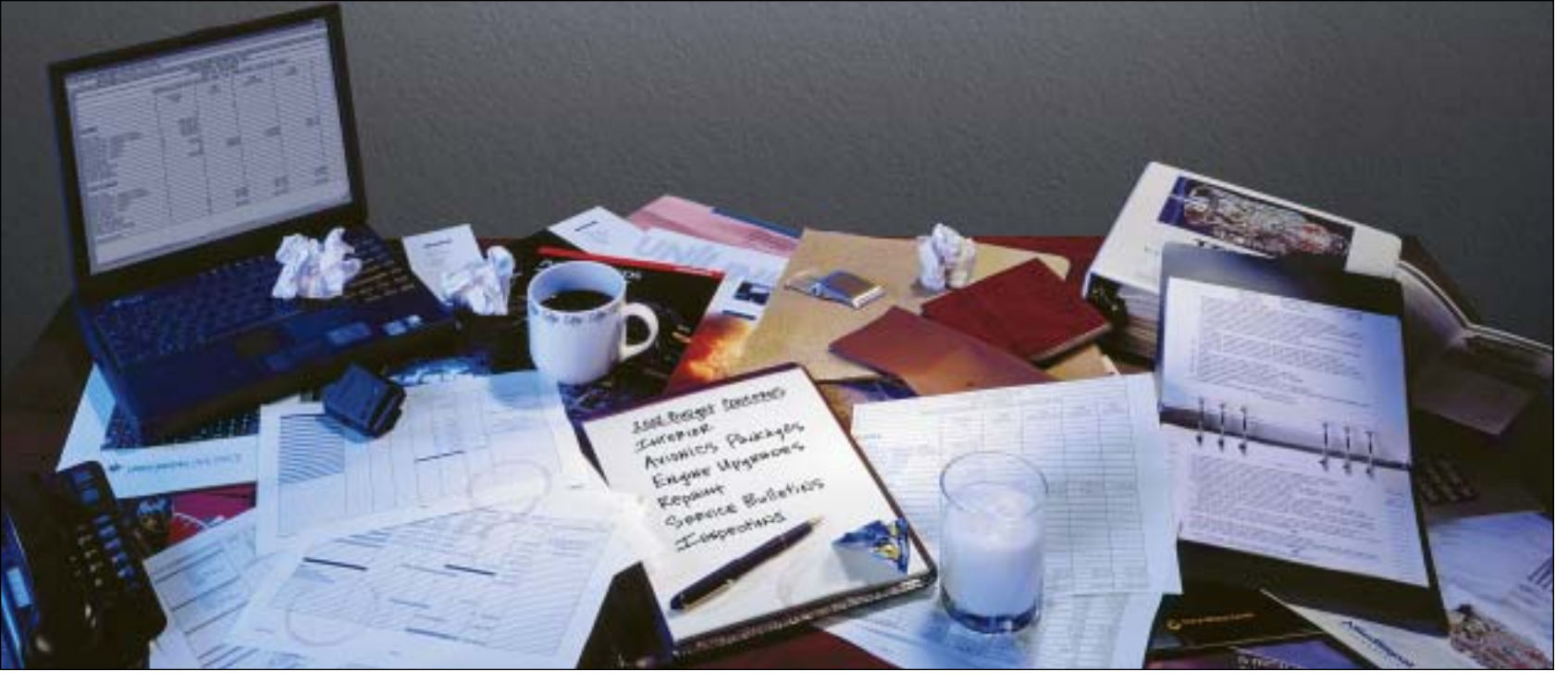
Tap into the experience of Duncan Aviation