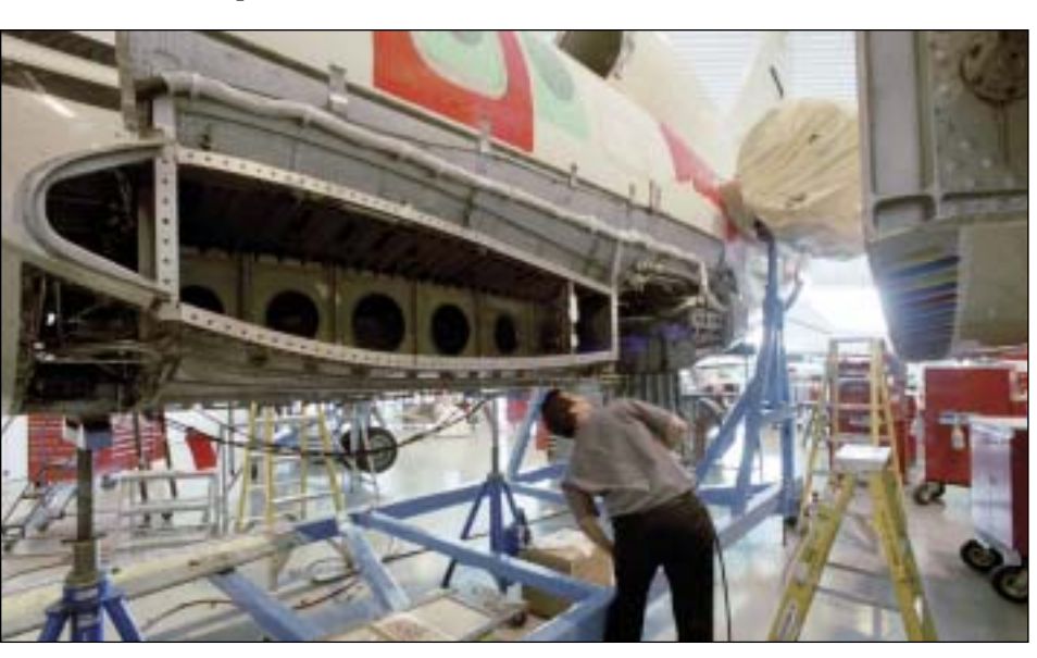
The Duncan Aviation Structures Team removes a wing from a Falcon 50 in order to repair corrosion found during an inspection.

The addition of a new 123,000-square-foot facility in Lincoln, Nebraska, furthers our commitment to being the one-stop-shop for an entire aircraft. Service includes interior refurbishment, paint, avionics installation and modification, engine maintenance, APUs, avionics, instrument and accessory repair/overhaul and parts support. From sales staff and technical representatives to inspectors and technicians, our core airframe teams are the experts for your model. Here, we provide a brief overview of these seven airframe models and some of our capabilities on each.