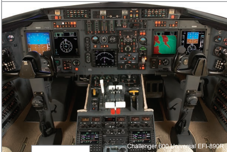
Challenger 600 Universal EFI-890R