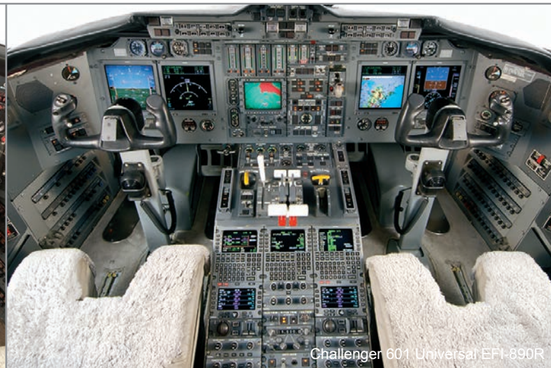
Challenger 601 Universal EFI-890R