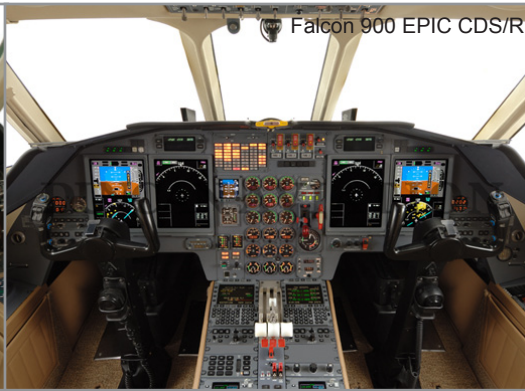
Falcon 900 EPIC CDS/R