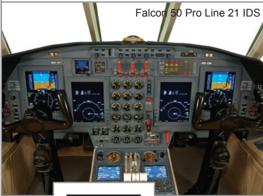
Falcon 50 Pro Line 21 IDS