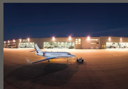
Battle Creek, Michigan