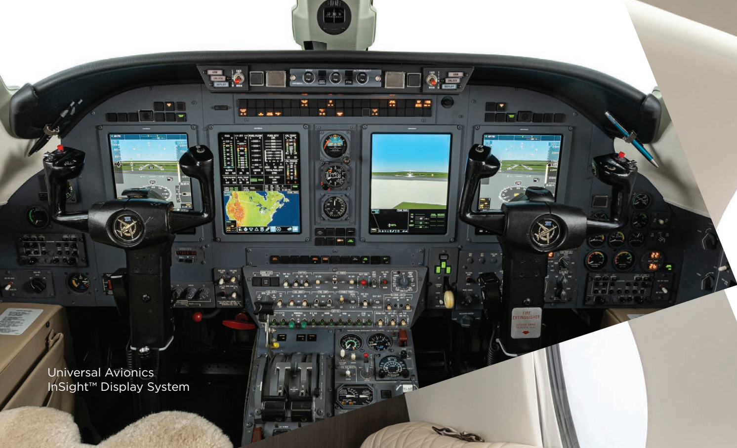
Universal Avionics InSight™ Display System