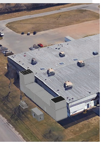
Test Cell Rendering from Atec. Inc.

The Transitional Winglet upgrade will provide Sovereign owners and operators with greater operational flexibility and performance benefits, such as increased speed at altitude, increased range/payload, improved time-to-climb, and more.