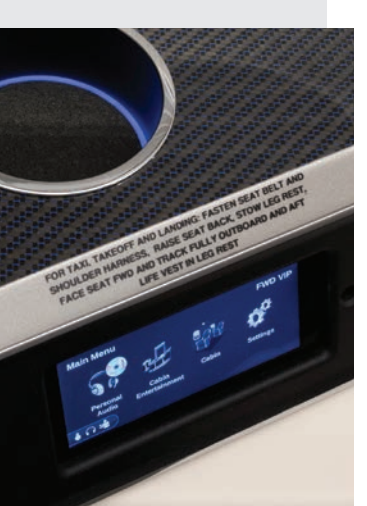
Rockwell Collins Venue™ installed in a Global Express.

Our satellite shops are located at the busiest corporate aviation airports around the country. See a map here: www.DuncanAviation.aero/locations/#satellites.